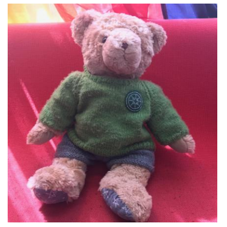
'Be There Bear'

The school promotes high levels of attendance for all its pupils. For a child to reach their full educational potential a high level of attendance is essential. Ideally, we would like children to achieve 100% attendance. School attendance is subject to various laws and our school attendance policy reflects this. If your child's attendance falls below 96% you will receive a letter concerning this, explaining what possible actions may be taken. Holidays during term time will not be authorised, and if they are taken they may meet the criteria for legal intervention from the County Attendance Officer or ultimately a Fixed Penalty Notice. A holiday form must be completed for any holiday request. 'Be There Bear' and a certificate is given to the class with the best weekly attendance.